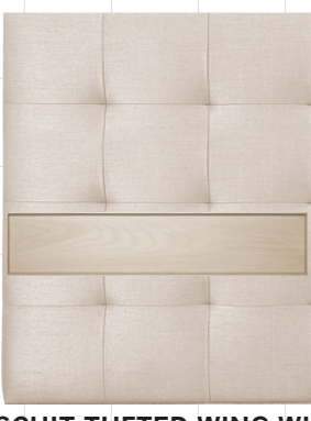
BISCUIT TUFTED WING WITH FLOATING NIGHTSTAND Standard with Power Access*

Left Wing (V41BPLNW) / Right Wing (V41BPRNW)