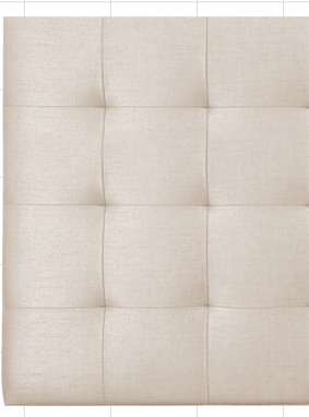
BISCUIT TUFTED WING

Left Wing (V41BPLPW) / Right Wing (V41BPRPW)