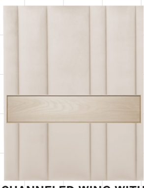
CHANNELED WING WITH FLOATING NIGHTSTAND Standard with Power Access*

Left Wing (V41BBLNW) / Right Wing (V41BBRNW)