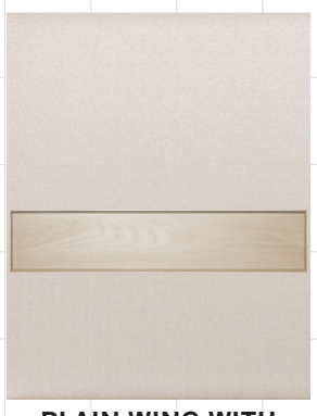
PLAIN WING WITH FLOATING NIGHTSTAND Standard with Power Access*

6 ADD OPTIONAL WING PANELS WITH FLOATING NIGHTSTAND.